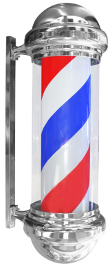
(Salon pole control)