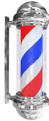
(Salon pole control)